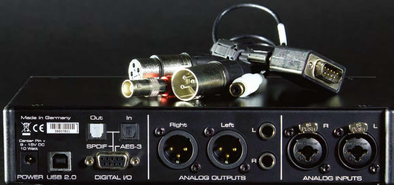
The optical input automatically detects the presence of a S/PDIF or ADAT signal, and can accept either (though only two ADAT channels are usable).

» line driver, too, if additional analogue outputs are required. The output level for 3-4 is selected in the configuration software, but for 1-2 it follows the analogue output reference level setting, operating in Standard mode for the +4 and +13 dBu presets, and Hi-power in the +19 and +24 dBu settings.